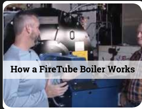
How a FireTube Boiler Works