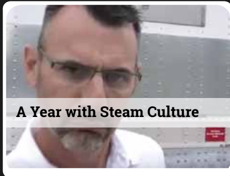
A Year with Steam Culture