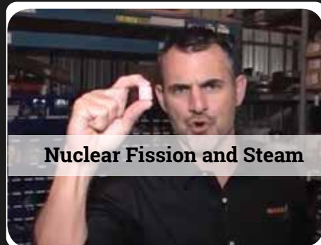
Nuclear Fission and Steam