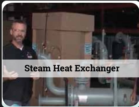
Steam Heat Exchanger