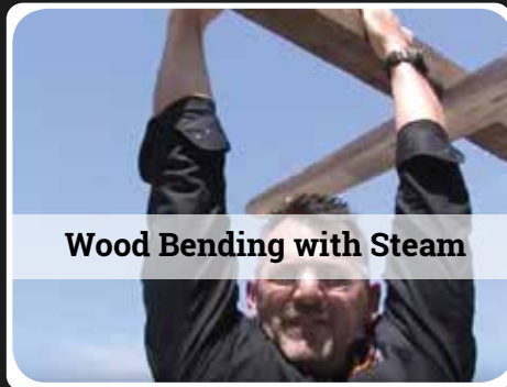
Wood Bending with Steam